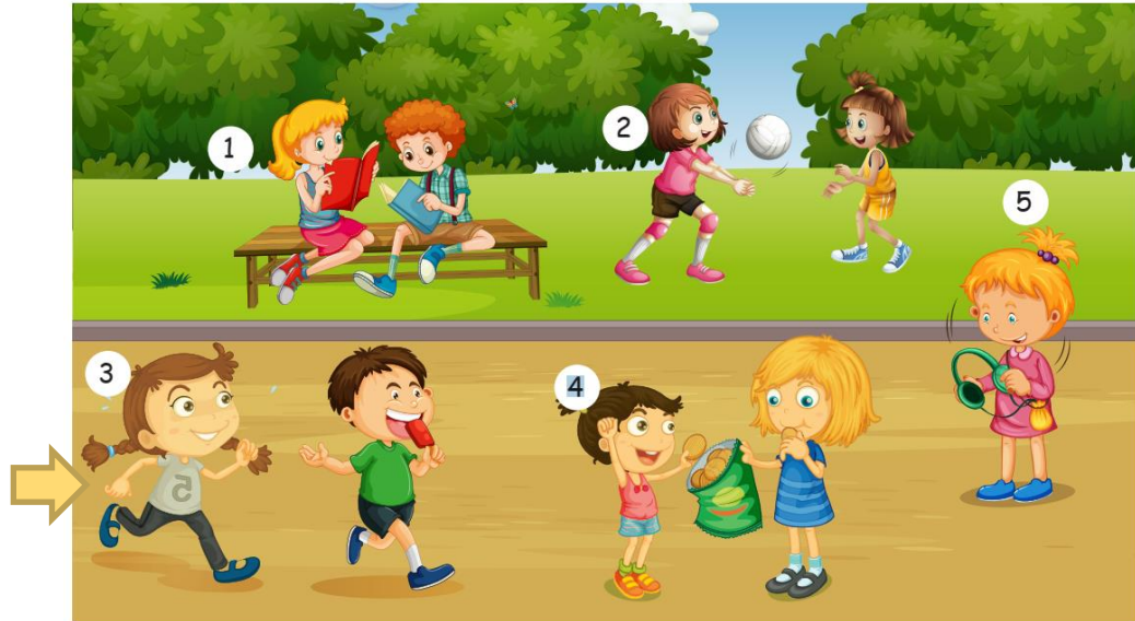
3. She is running. (running)