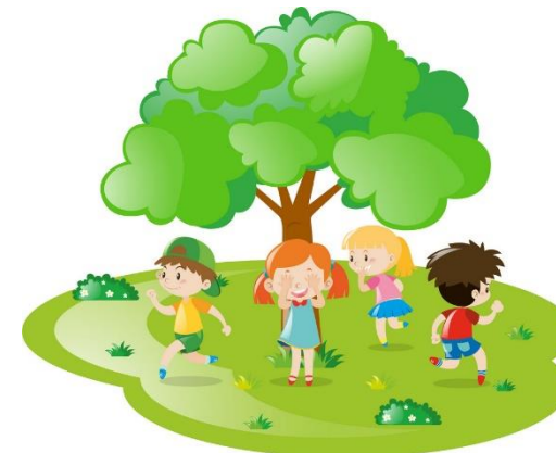
blind man's bluff