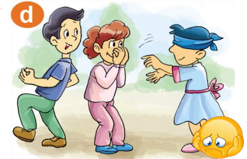
blind man's bluff