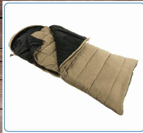
6 sleeping bag