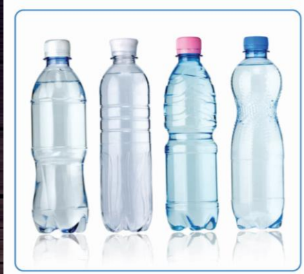
2 bottled water