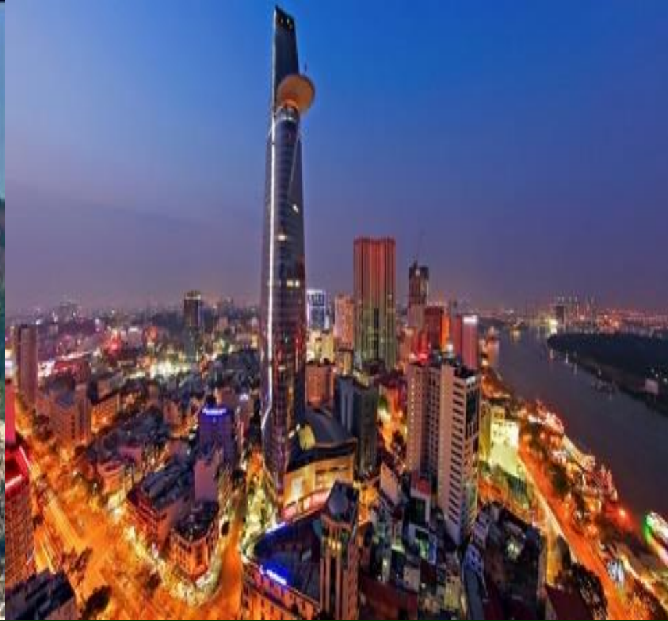
Ho Chi Minh City Population: 8,426 million people (2016)