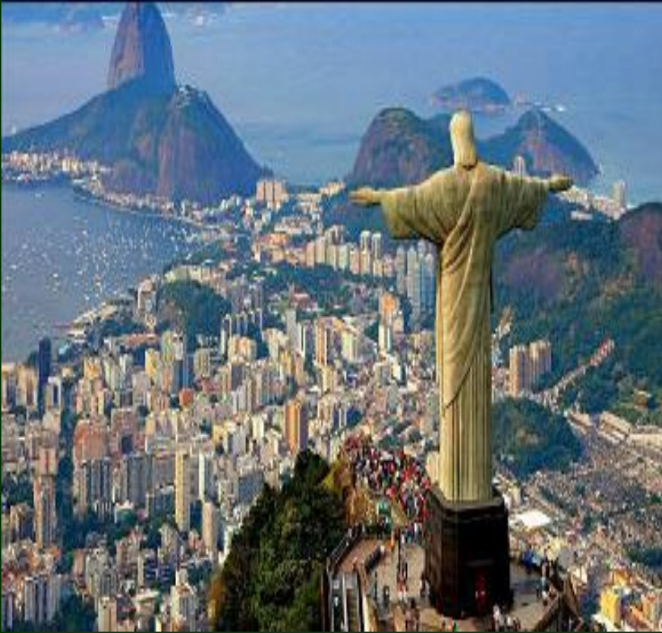
Rio de Janeiro Population: 12,981 million people (2016)