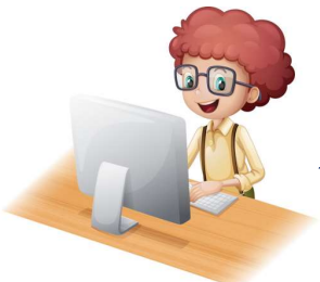
surf the Internet