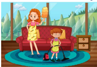
clean the house