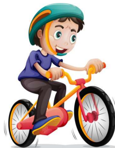
ride my bike