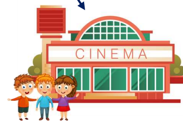
go to the cinema