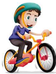
ride my bike