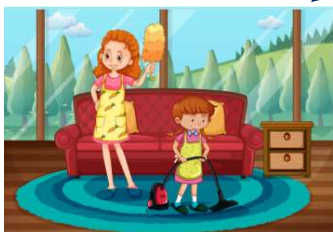
clean the house