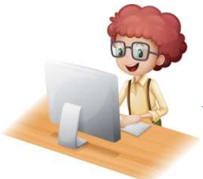
surf the Internet