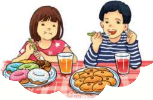
eat - have ăn