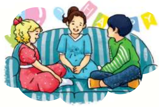
chat nói chuyện