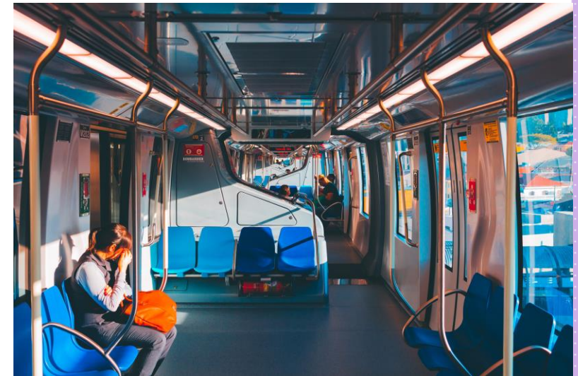
public transport system (n.ph)